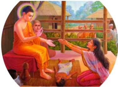
Kisa visiting the Buddha