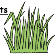
In short grass.