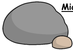
Under stones and rocks.