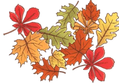
Under fallen leaves.