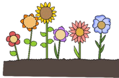
In tall grass and flowers.