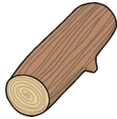
Inside rotting wood.